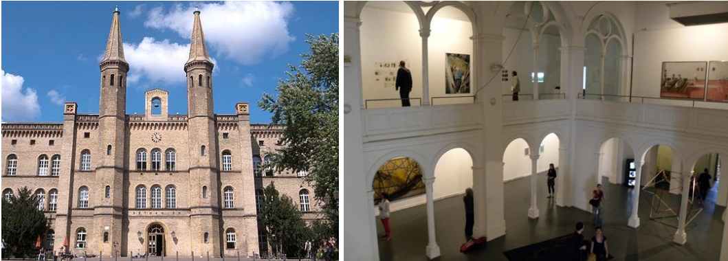
"Kunstquartier Bethanien", Berlin

The venue for the IAM exhibitions is the famous "Kunstquartier Bethanien" in Berlin, a former historic diaconal hospital building complex with a strong political history located in the center and melting pot of Berlin Kreuzberg. Since 2010 this building is used by the "Kunstquartier Bethanien" for arts of all media, artist groups and cultural institutions.